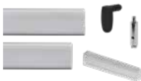
STAS signtrack set 42 and 60 cm PS10042 42 cm PS10060 60 cm