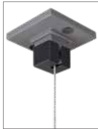
STAS qubic pro TCS1010