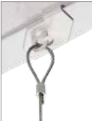
STAS drop ceiling hook for loop HA10200 max 5 kg

STAS drop ceiling hook for loop with perlon cord or steel cable with loop.