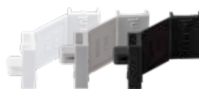
RY10200 combicap white RY30200 combicap alu RY20200 combicap black (2 x end cap / 1 x corner cap)