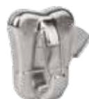
STAS zipper pro