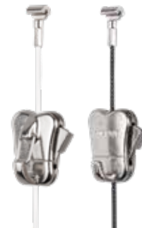
steel cable white or black + zipper or zipper pro