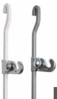
j-rail max rod 4x4 + j-rail max (security) hook